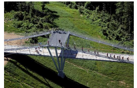
Action Bridge at the Summit