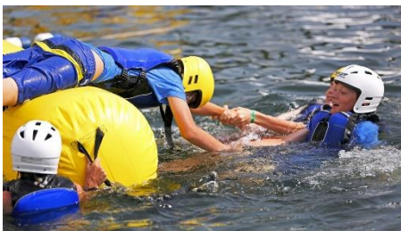
Jamboree Water Obstacle Course

Parents please plan to attend we will review many topics of interest.