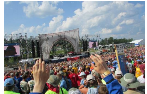
The Stadium show at the 2013 National Scout Jamboree – 38,000 of your fellow scouts enjoy the show!