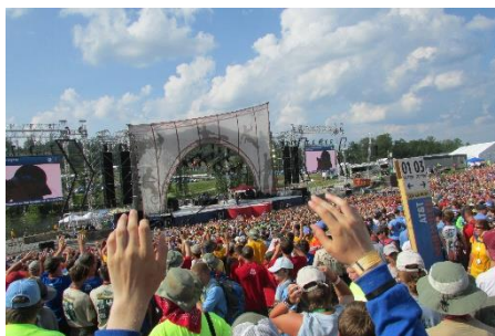
The Stadium show at the 2013 National Scout Jamboree – 38,000 of your fellow scouts enjoy the show!

If you are interested, please send me your order form.