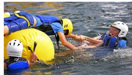
Jamboree Water Obstacle Course

Parents please plan to attend we will review many topics of interest.