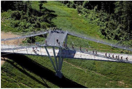
Action Bridge at the Summit