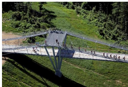
Action Bridge at the Summit

Moved? Changed your Phone Number? Changed you email?