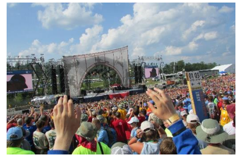
The Stadium show at the 2013 National Scout Jamboree – 38,000 of your fellow scouts enjoy the show!