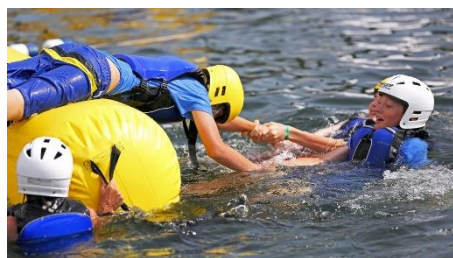
Jamboree Water Obstacle Course

The Jamboree Crew will have its next meeting on Saturday, April 22, 2017 at the Jamboree Shakedown Weekend.