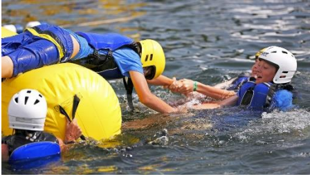
Jamboree Water Obstacle Course