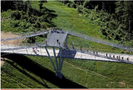
Action Bridge at the Summit