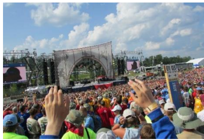
The Stadium show at the 2013 National Scout Jamboree – 38,000 of your fellow scouts enjoy the show!