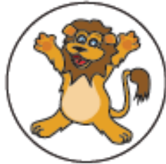
Fun on the Run