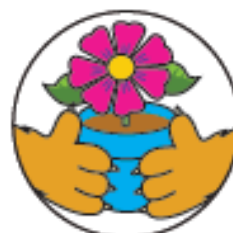
Ready, Set, Grow