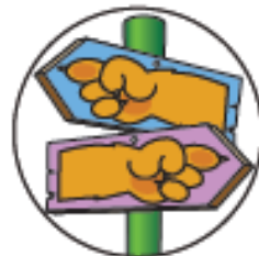
Pick My Path