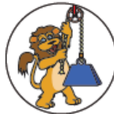
Gizmos and Gadgets