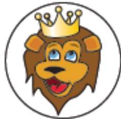
King of the Jungle