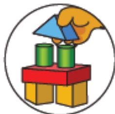
Build It Up, Knock It Down