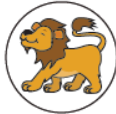
I'll Do It Myself