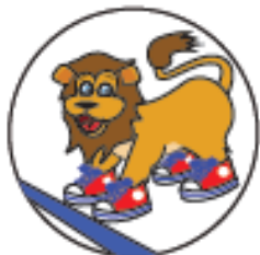
On Your Mark