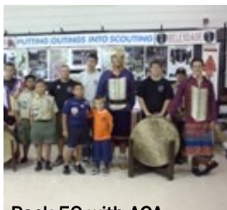
Pack 59 with ACA

3 Cub Scouts from Pack 59 became the newest members of ACA Chapter's drum team and made their first public performance at the OA Conclave. They practiced for several weeks so they could be a part of the action at the Conclave. Special thanks to them for their great performance.