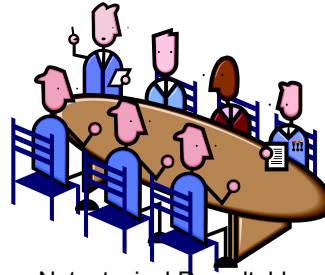
Not a typical Roundtable; roundtables are hands-on.

Vickey Hermes, the District Scout Roundtable